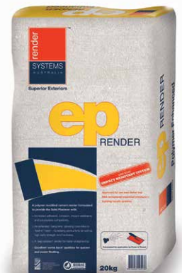
RSA EP Render – Off-white