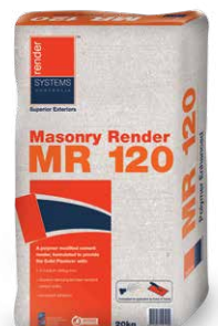
RSA MR 120 – Off-white