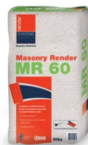
RSA MR 60 – Off-white