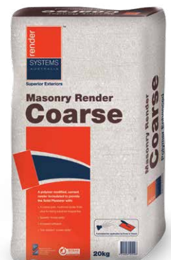
RSA Masonry Render Coarse – Off-white